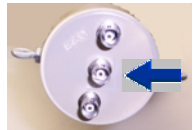
Figure 7 - Bottom View Arrow points to radio connection